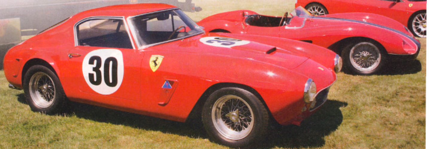
Ferrari's sublime 250 GT SWB, designed by Pinin Farina and built by Carrozzeria Scaglietti, was the epitome of the early Sixties sports racer, equally at home on track or road. This 1960 example, parked next to the purposefully beautiful 1956 500 TRC, was shown by Classic Coach.