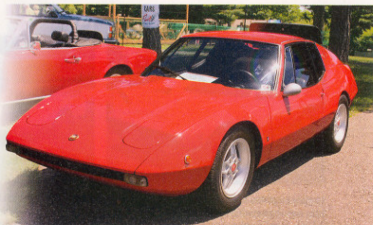
Cute as a bug and exceedingly rare was this 1970 Lombardi Grand Prix belonging to Haz Neuman of Whiteford, Maryland; the steel body two-seater rides on a rear-engine Fiat 850 sedan chassis and is powered by a 75hp, 1,013cc four-cylinder.