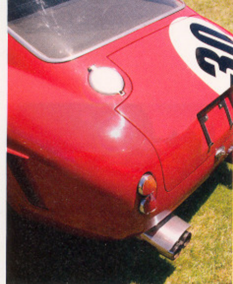
Automotive sculpture: Form followed function beautifully in the Pininfarina-designed short-wheelbase Ferrari 250 GT berlinetta.