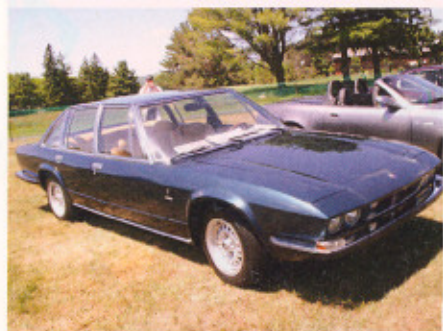
Only two of these Frua-built Maserati Quattroporte four-doors were built, with the first, the 1971 Paris/1972 Geneva auto show car going to Spain's King Juan Carlos, and the second, built in 1974, going to the Aga Khan; power comes from a 330hp, 4.7-liter V-8.